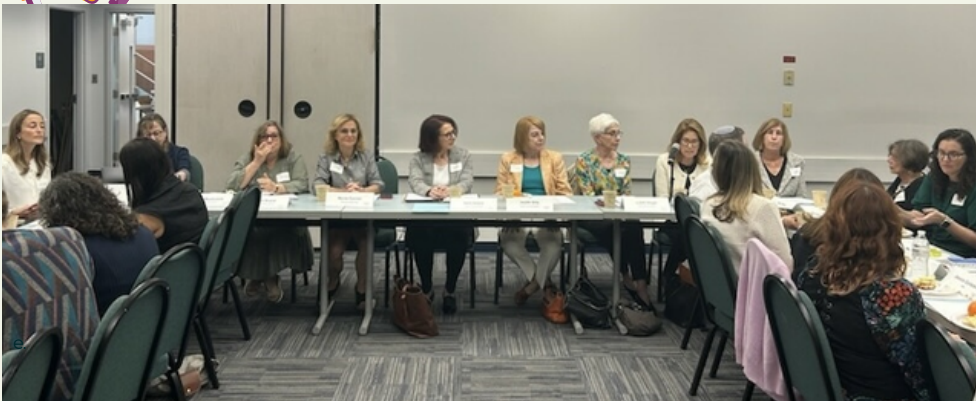
NEW GRANTEE ORIENTATION AND LEARNING SESSION SEPT 2024