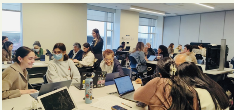
TECHNOLOGY TRAINING WITH OLDER ADULTS, PARTNERSHIP WITH VARIOUS UNIVERSITY TRAINEES.

Kudos to the JCC for making excellent and enjoyable use of this $5,000 grant!