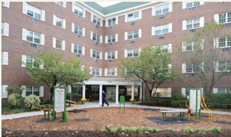
JCHC-BNAI BRITH HOUSING, SOUTH ORANGE, NJ

In early 2023, Funds were awarded to support the expansion of a supportive housing model in New Jersey, Assisted Living Program (ALP).