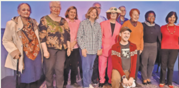
CHATHAM SENIOR CENTER - WRITING AND ACTING SOCIAL INTERACTIONS

SUPPORTING NEW ACTIVITIES TO SPUR FRIENDSHIPS AND SOCIAL CONNECTIONS, AND REDUCE SOCIAL ISOLATION