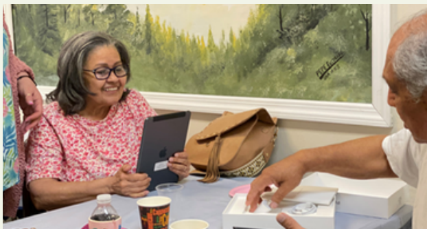
FOCUS HISPANIC CENTER - NEWARK - TECH TRAINING