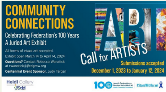
Exhibit Open March 14 to April 14 2024

In celebration of the Federation's Centennial year, submit your art for a Juried Art Exhibit at JSDD's Heidi Gallery between December 1, 2023 and January 12, 2024.