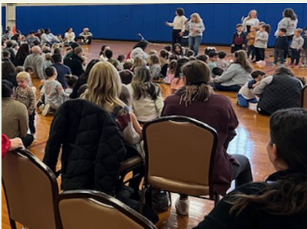
JCC SCOTCH PLAINS - GRANDPARENTS CIRCLE